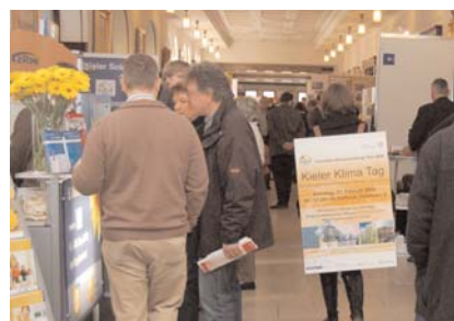
1.200 people in the rooms of the Kiel City Hall