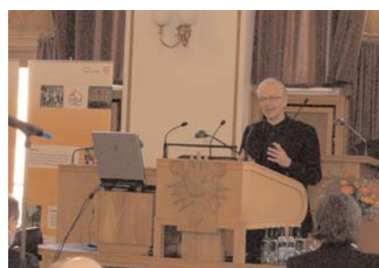
Mayor Todeskino in the "Ratssaal" (council hall)

Mini-phenomena, suitable for children exhibition with about 50 interactive experiments, was created for young public.