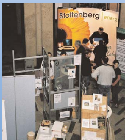
over 60 fair stands in the great hall