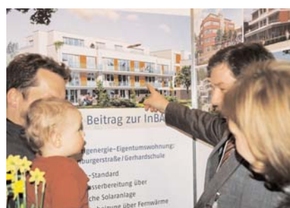
InBA project "Gerhardschule" at the exhibition